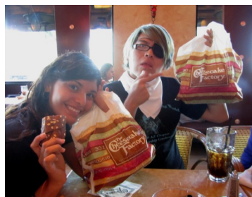
Dinner at Cheese Cake Factory