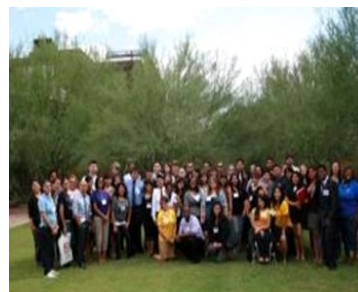
2011 Arizona WESTOP Student Leadership Participants