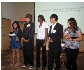
Call to Action Presentations

Knowledge is like climbing a mountain; The higher you reach the more you can see and appreciate.